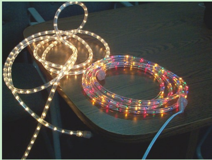
Snoezelen Multi Sensory Activities

NOW YOU CAN EARN ALL 30 N.C.C.A.P. APPROVED CE CREDITS AT HOME/ WORK WITH YOUR RESIDENTS